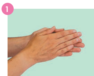
1 rub palm on palm

Standard hand-rub method in accordance with EN 1500