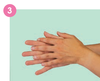
3 rub palm on palm with fingers interlaced